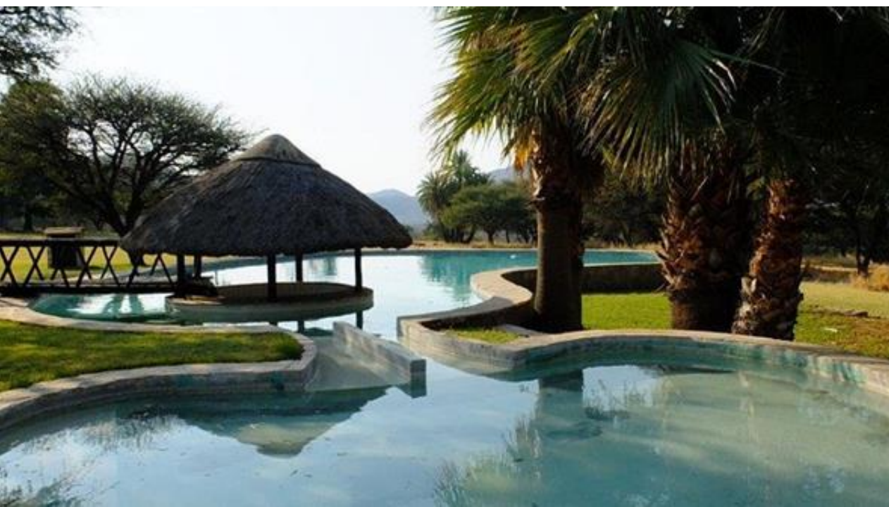
Otavi Ghaub Campsite & Caves Grootfontein Hoba Meteorite