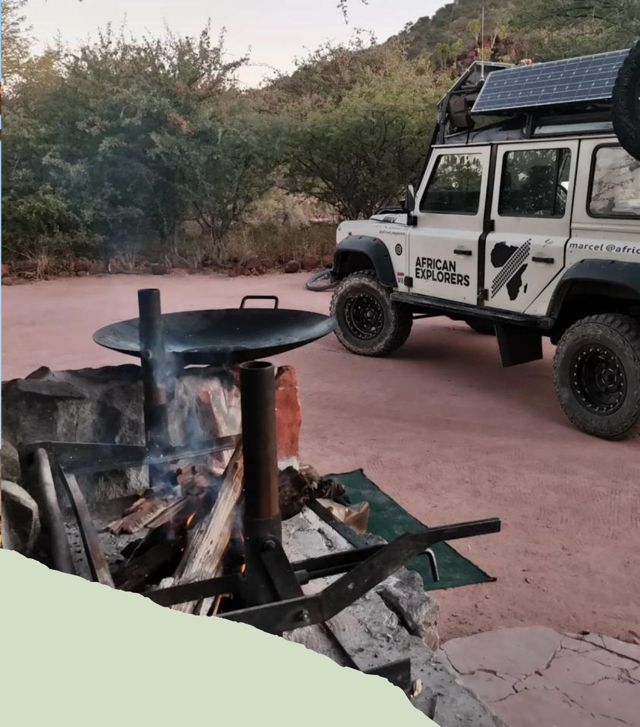
Desolation Valley Wild Camp