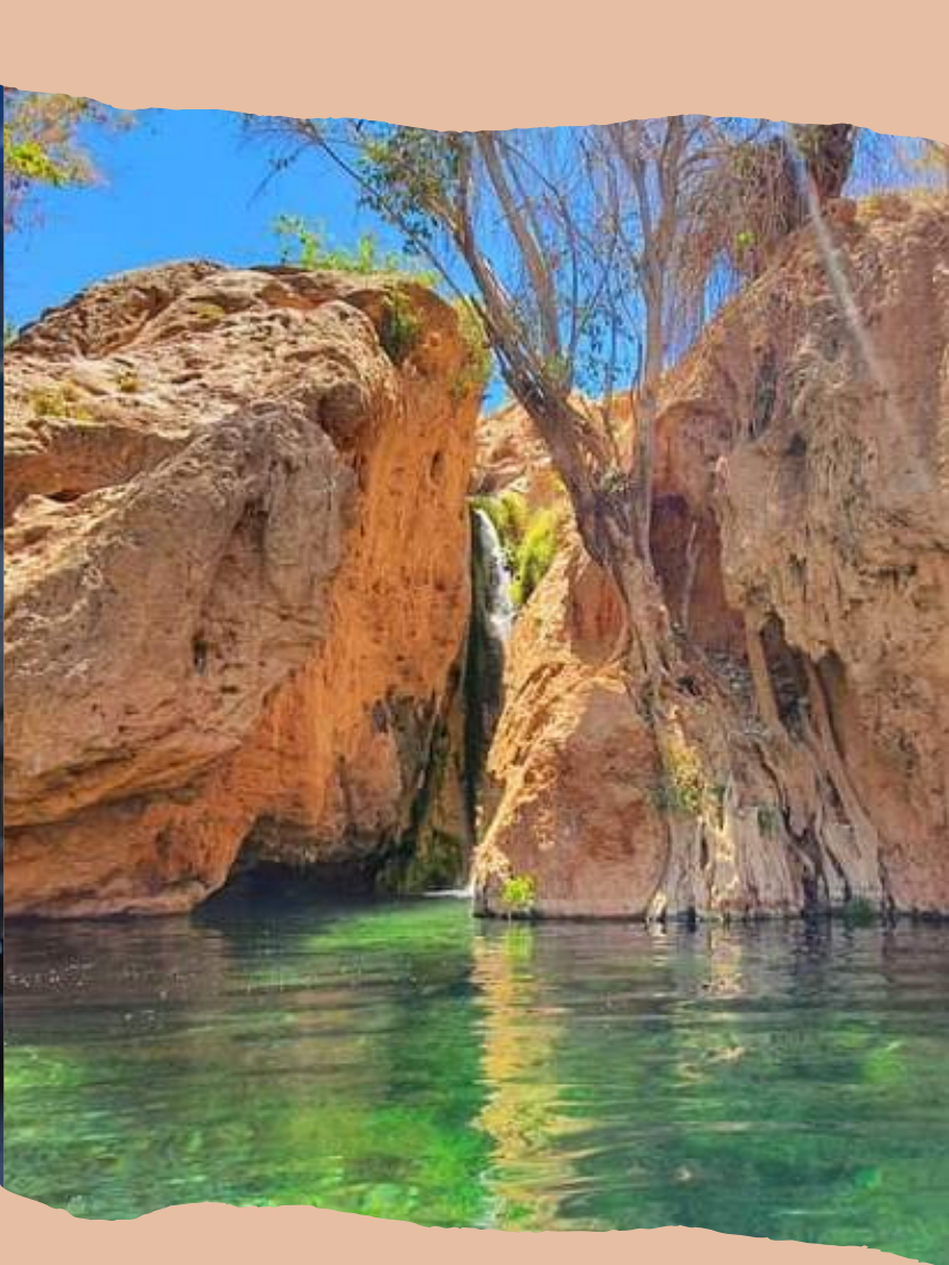
Ongongo Waterfall Campsite