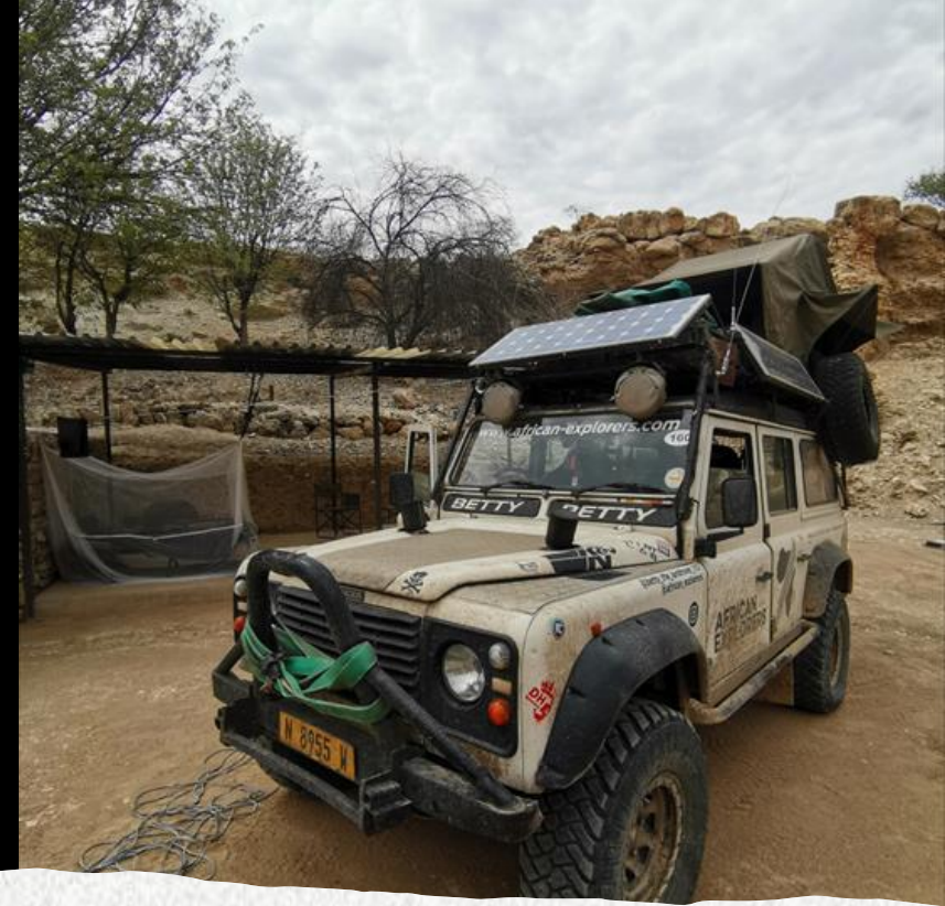
Ongongo Waterfall Campsite